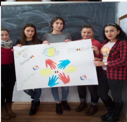
Celebrating our National Day 2018